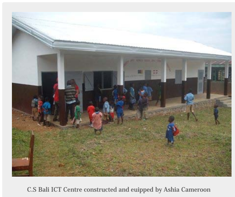
C.S Bali ICT Centre constructed and equipped by Ashia Cameroon

Ashia Cameroon, a Child centered humanitarian NGO, has handed over to the authorities of catholic School Bali, two constructed ICT halls, each stuffed with 24 Dell and HP laptops and printers and two classrooms and toilet facilities to Presbyterian Primary School Tikali, in two separate ceremonies that took place at the respective schools Friday December 13, 2013.