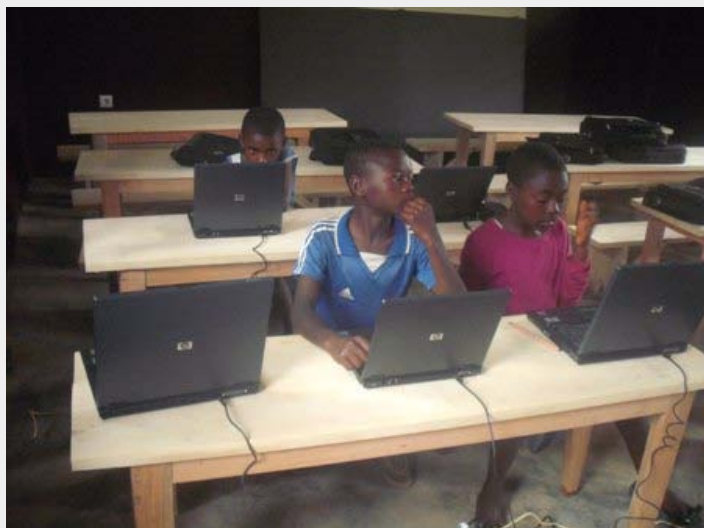
Each hall is equipped with 25 laptops, and a printer